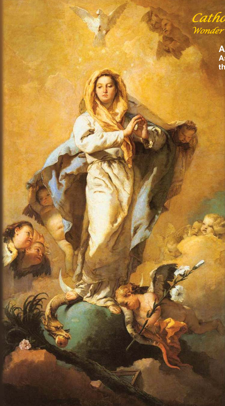
The Miraculous Assumption of Mary

August 15, 2010 Assumption of the Blessed Virgin