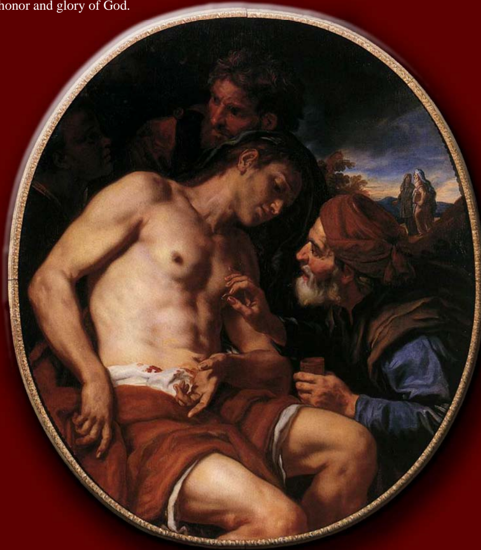
Johann Karl Loth, 1676

15th Sunday in Ordinary Time July 11, 2010