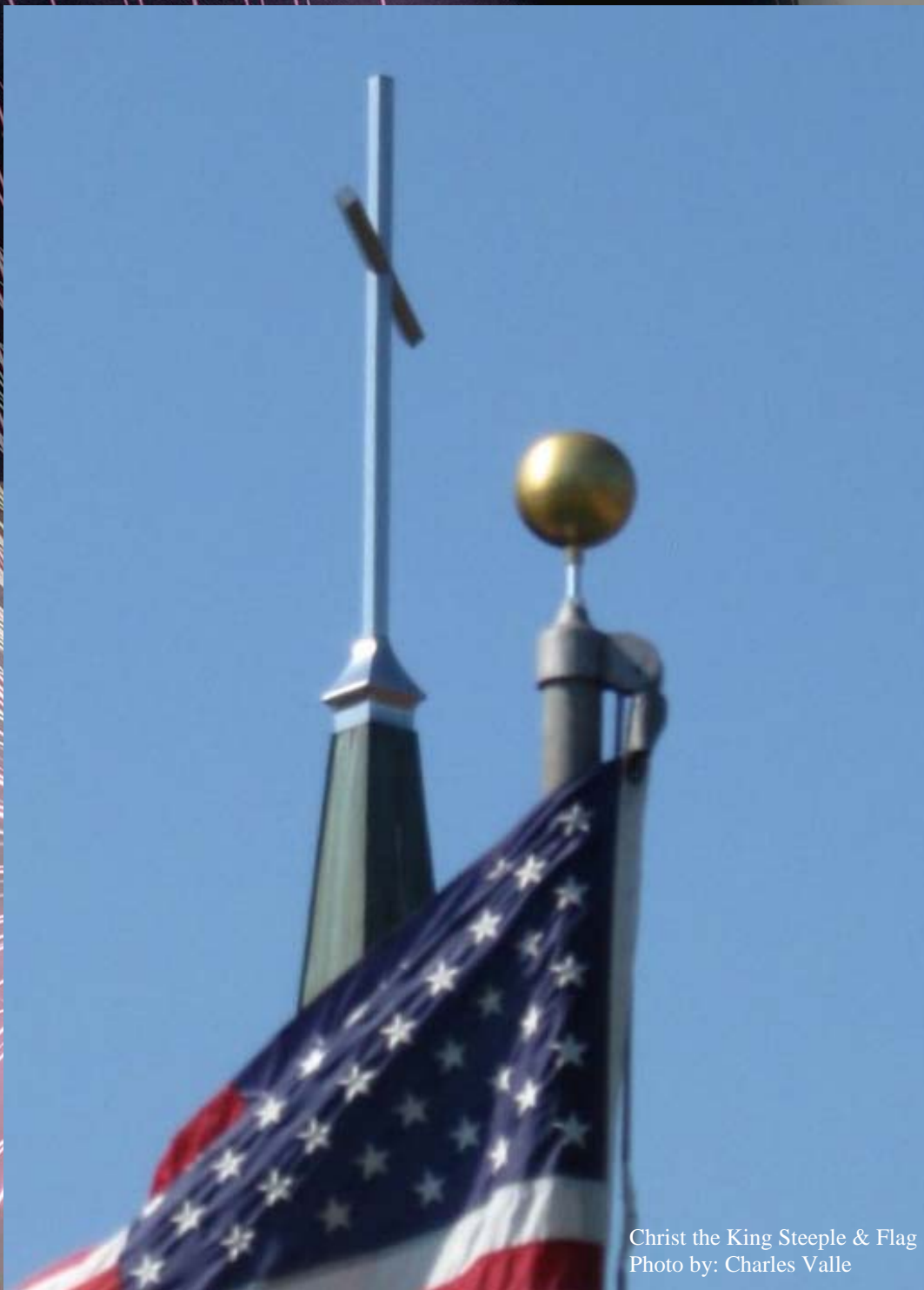
Christ the King Steeple & Flag