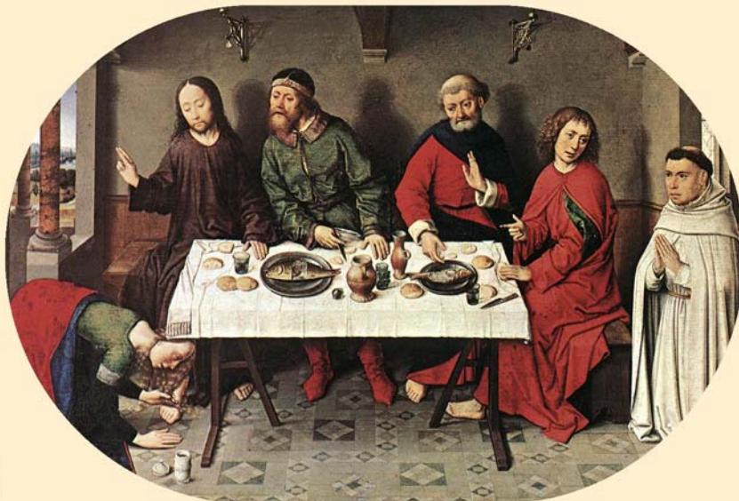
Dieric the Elder Bouts, 1440s