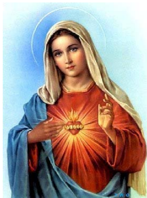
Sweet Heart of Mary, be our Salvation!

Our Lord dictated the following prayer to St. Gertrude the Great to release 1,000 Souls from Purgatory each time it is said. Eternal Father, I offer Thee the Most Precious Blood of Thy Divine Son, Jesus, in union with the masses said throughout the world today, for all the holy souls in Purgatory, for sinners everywhere, for sinners in the universal church, those in my own home and within my family. Amen."