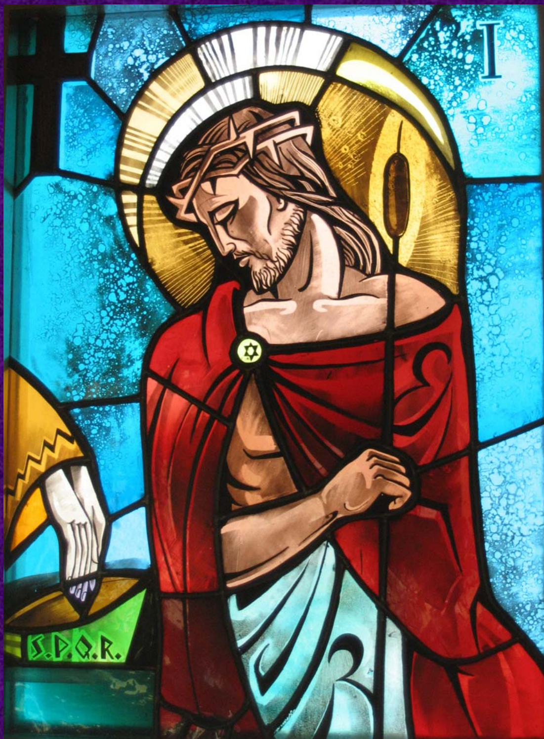
Christ the King Church, Wonder Lake, Stained Glass First Station